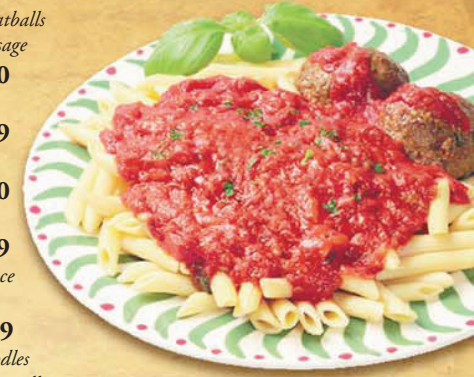
Pasta sauce choices: Marinara or Meat Sauce